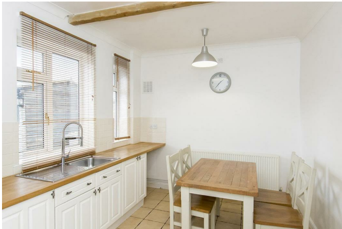
Kitchen/Diner 17'6" x 9'6" (5.33m x 2.90m)

Two UPVC double-glazed windows to front. Fitted range of wall and floor mounted units. Worktops over with stainless steel sink inset. Electric oven. Induction hob with extractor hood over. Space and plumbing for washing machine. Space for fridge/freezer. Tiled splash backs. Tiled flooring. Radiator.